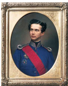
King Ludwig II

The group will spend a week in Munich, a week in Vienna, and two weeks in Dorf Tirol in Italy.