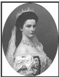
Empress Elisabeth of Austria

Austria, his cousin and soulmate! Visit King Ludwig's castles and find out what role Wagner's music played in the development of Ludwig's artistic inclinations! Read Empress Elisabeth's Poetic Diaries , in which she claimed to channel the German poet Heinrich