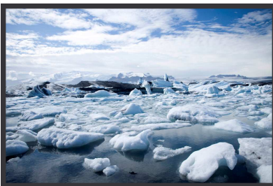
Glacier in Iceland