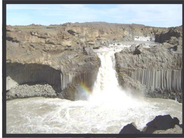
Aldeyjarfoss, one of the greatest tourist attractions near Svartárfkot

Program Descriptions: Iceland possesses a landscape like no other, with lava fields, geysers, waterfalls, jagged mountains and coastlines, green fields, and glaciers. The island had no indigenous population, and when the Norse settled it beginning around 900, their effect on the land quickly became apparent. The literature, culture, and environmental impact of the early inhabitants of Iceland form the focus of this course, with readings from Iceland's medieval sagas as well as from modern scientific studies of the impact of human habitation on the land. The course will take place in Iceland's capital city, Reykjavik, as well as at a sheep farm, Svartárfkot, in northern Iceland, and will run from May 17 to June 2, 3, or 4.